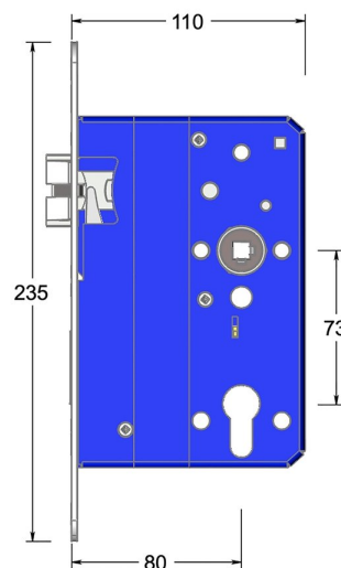
Dimensions drawing (DIM)